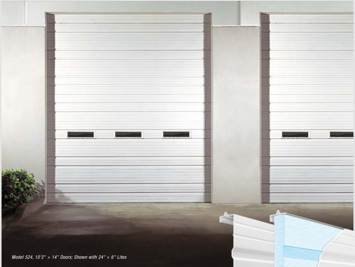
Model 524, 10'2" x 14" Doors; Shown with 24" x 6" Lites