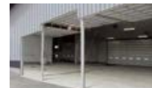
Carry-away, roll-away or swing-up mullions are available on select sizes.