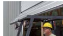
Single section and double sections available on select sizes. (3200)