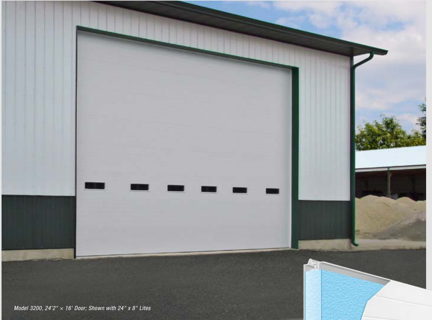
Model 3200, 24'2" x 16' Door; Shown with 24" x 8" Lites