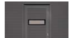
32" wide x 80" high, max 16'2" wide section. (3200)