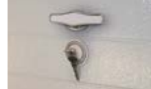
Outside keyed lock