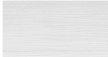
FLUSH PANEL WITH WOODGRAIN EMBOSSEMENT