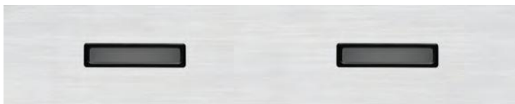
24" X 6" DOUBLE INSULATED ACRYLIC**